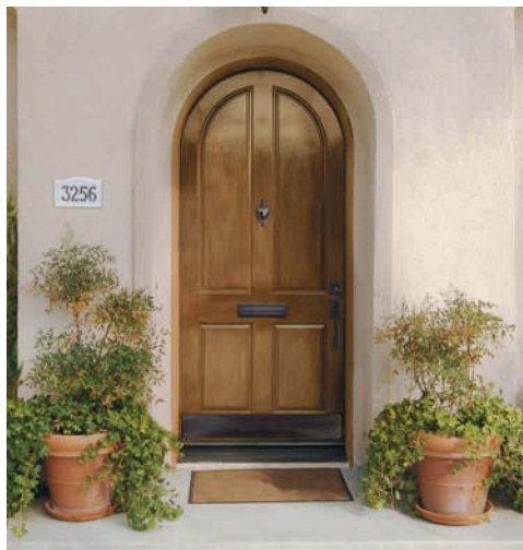
Making a grand entrance – Taymor’s suiteing program helps builders exceed homebuyer expectations whether their design inspiration is heritage, modern or transitional.