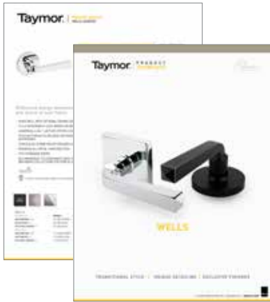
CUSTOMIZED DOCUMENTS & SELL SHEETS