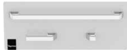
MOUNTED BATHWARE PRODUCT SAMPLES