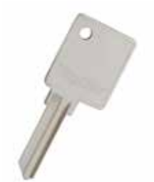
CUSTOM LOGO KEYS