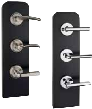
MOUNTED DOORWARE PRODUCT SAMPLES