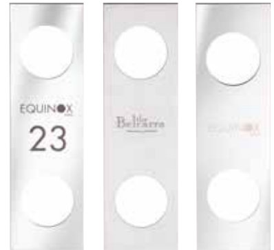
CUSTOM ESCUTCHEON ETCHING