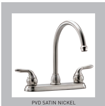
PVD SATIN NICKEL