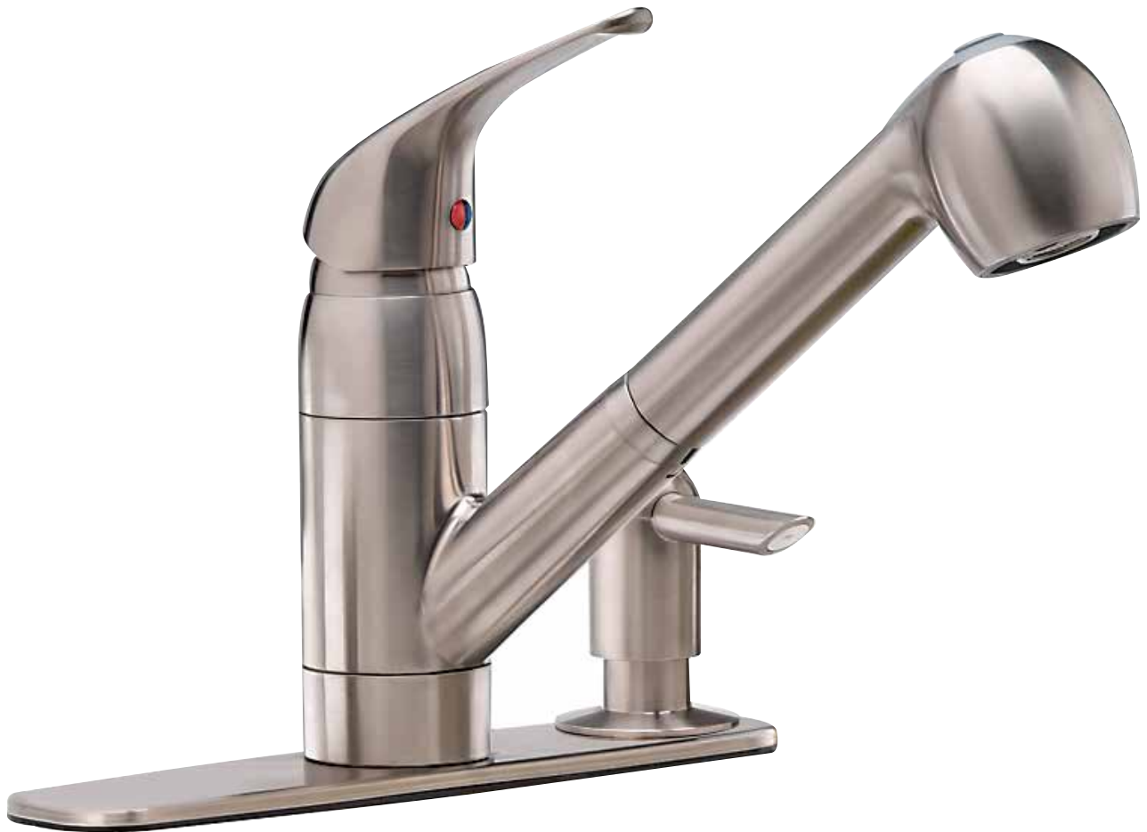
PVD SATIN NICKEL