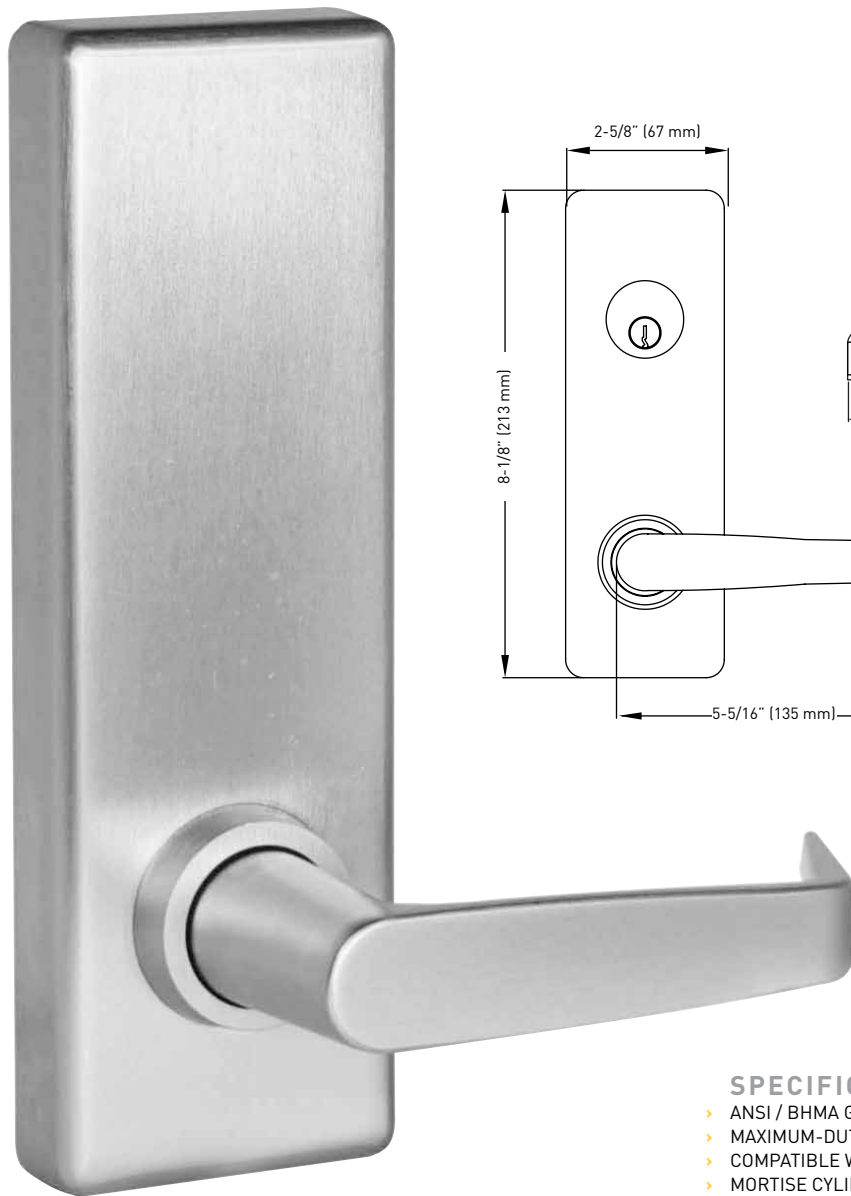
ESCUTCHEON LEVER TRIM