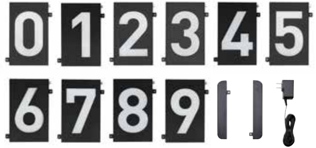
1/2" (12 mm) DEEP HOUSE NUMBERS